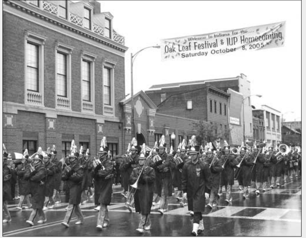
It rained on Homecoming, but it didn't really matter. Alumni and campus and community members still lined Philadelphia Street to see the annual parade.

For all dates, events, and details, see the online Central Calendar by accessing www.iup.edu ; follow the link marked "Calendar."