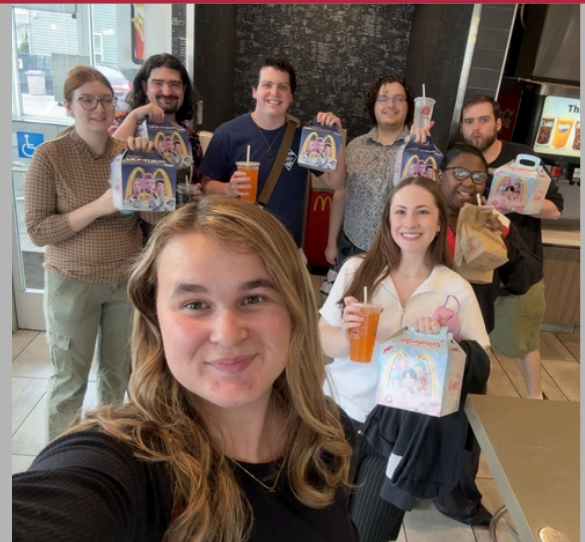
'26 Cohort Lunch Hangout