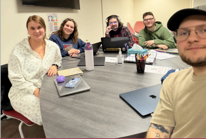
SAHE Study Session