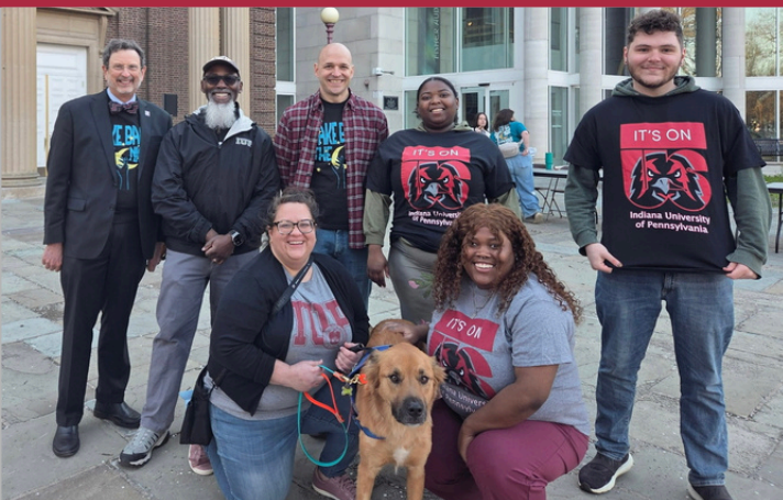
"It's On Us" Movement