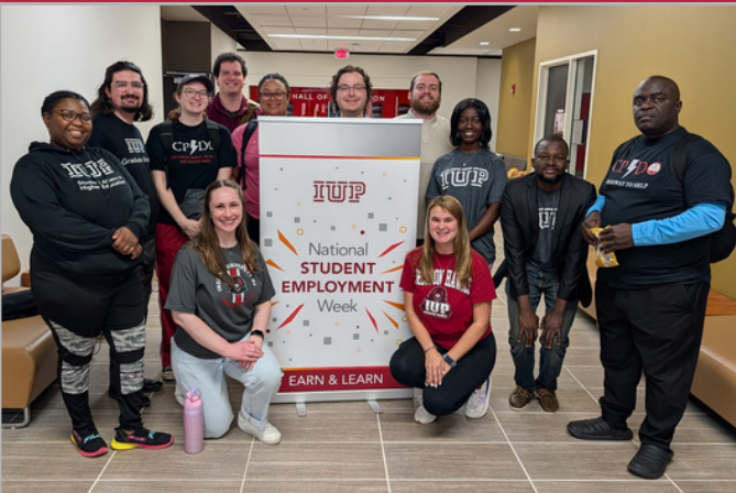
National Student Employment Week