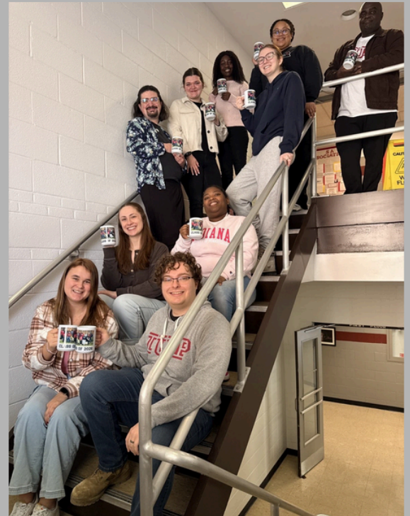
100 Days Until Graduation!