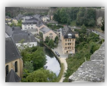
A view of Luxemburg