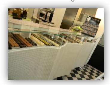
Chocolate shop in Bruges