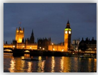
Parliament & Big Ben