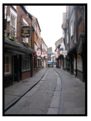
City of York, ancient city street called the Shambles adjacent to St. John University.