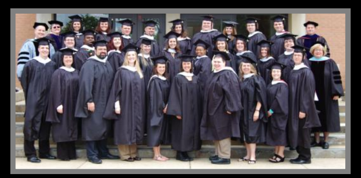
The Class of 2010 and faculty.