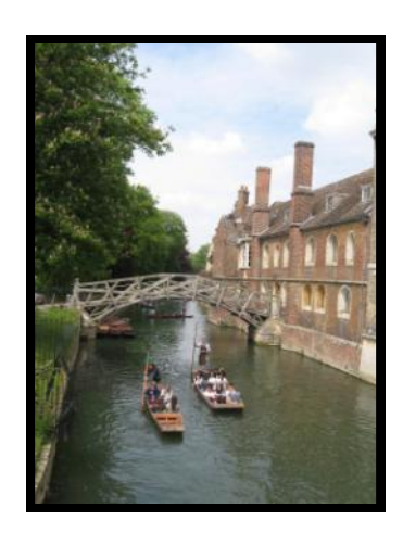
Students and tourists punting through Cambridge University.