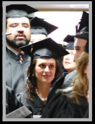
Students line up for processional.