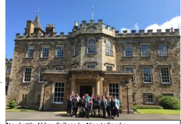
Newbattle Abbey College

It was an exhausting and overwhelming few weeks, but I came back with a new group of friends and colleagues in Ohio and a broadened perspective on this field that I am about to enter into in a few months.