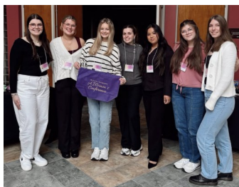
Above: Members of the Women In Business student organization attend the Women's Conference