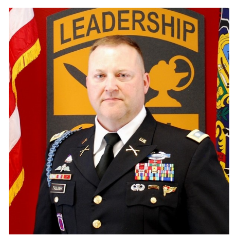
ni, parents, and supporters are welcome to attend. I look forward to seeing everyone at upcoming events and thank you for all you do to support the program and your cadets. Warriors First!

In April at the Military Ball we will be honoring the Class of 1999 Alumni as well as the Class of 2019 Commissionees. All alum-