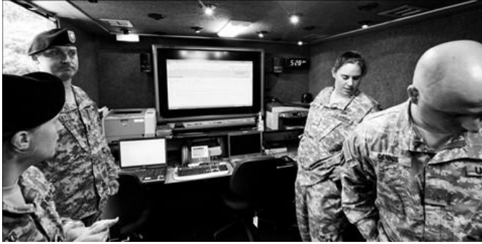
NGB CST Team Command Center