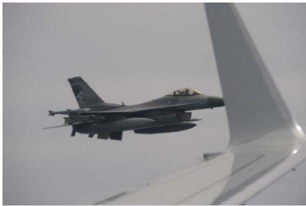
Naval Station Mayport, Mayport, Florida