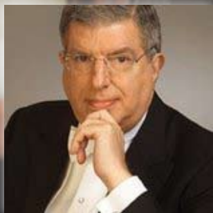
Helwig Distinguished Artist Marvin Hamlisch

COLLEGE OF FINE ARTS 2009-10 Series Events