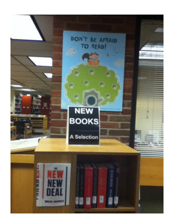
Check out the new book shelf in the Information Commons

IUP, where I helped with projects like our Coal Culture website and community events. My time in the library impacted me both educationally and personally. While working as a graduate assistant at Indiana State, I often looked to my time at IUP for ways to motivate the students I worked with. Now that I have returned to IUP, I look forward to learning even more as I work alongside the faculty, staff, and students who make up the IUP Library community.