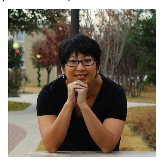
LM & TJ: What advice would you give to potential Zoom defenders?

AG: Relax. Don't overthink it. I know that videoconferencing can feel weird, and at first, you might feel detached if you're not used to it, but it really is a great tool. Your committee is still your committee, and they are still rooting for you. It's a bit different, but it's no less effective