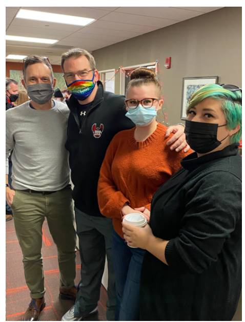
L&C faculty & students at English Dept Grab N' Gab