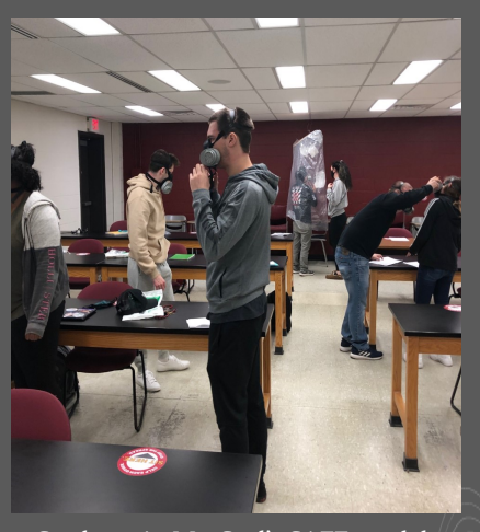
Students in Mr. Seal's SAFE 330 lab conducted respiratory fit testing.