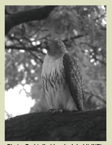
Photo: Red-tailed hawks inhabit IUP's Oak Grove. This photo, taken in August, 2006, was shot from the third floor of Sutton Hall.

facility, to be named after the Kovalchick family, is planned for 2008 with occupancy set for April 2011. The facility will include a 4,000- to 6,000-seat arena; administrative