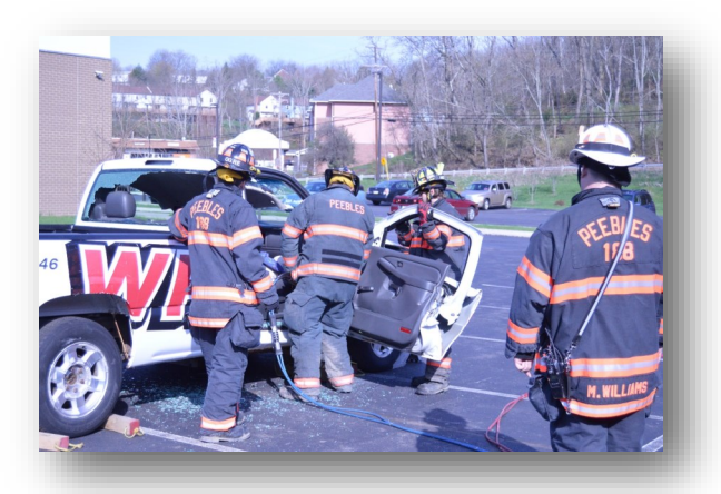
Protective services demonstration at Career Day held at AW Beattie Career Center in Allison Park