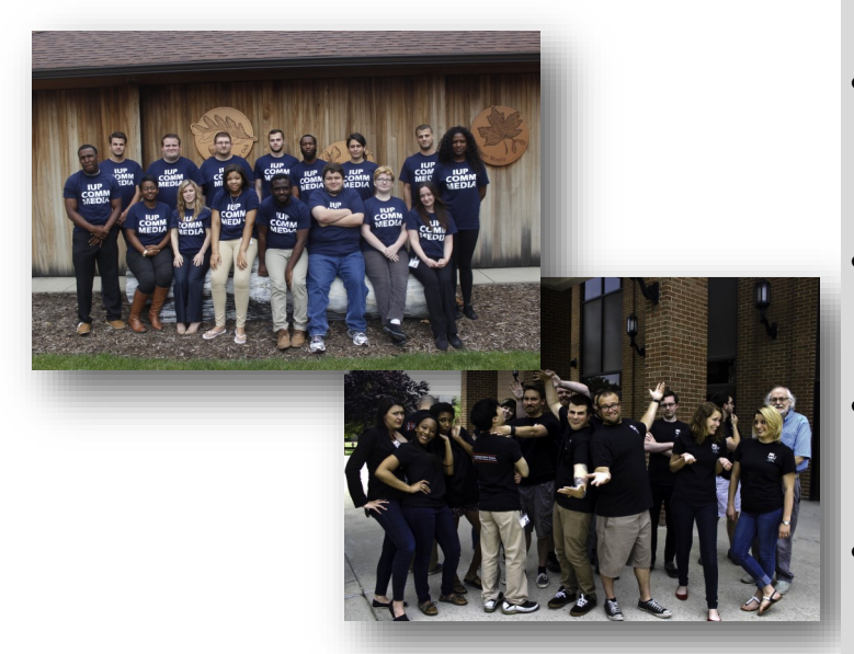
Members of the Center for Media Production and Research production team