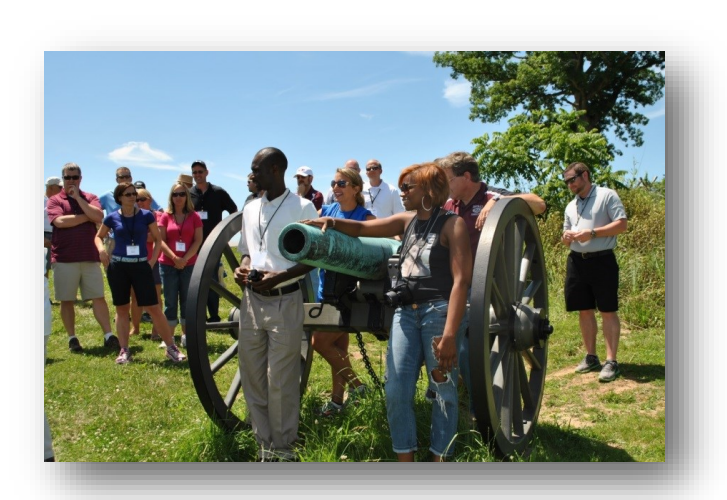
ALS Cohort 15 takes part in a "Leadership Walk across Gettysburg"