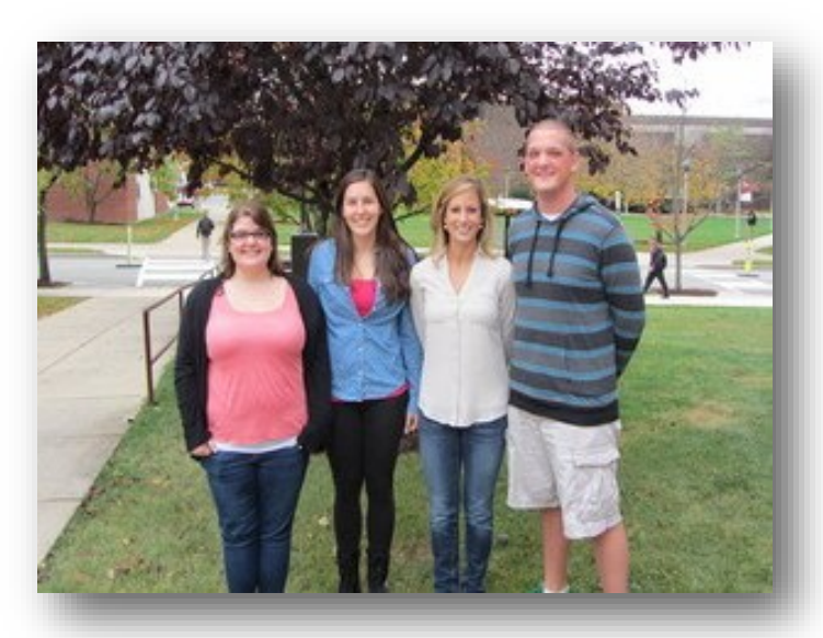
Students form the School Psychology Association Network