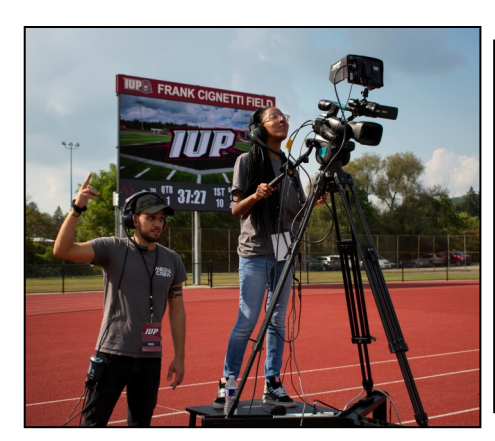
IUP-TV Sports Football Production

When The Princeton Review published the "The Best 385 Colleges" for 2019, IUP was on the list... as usual. We are particularly proud of comments from students about our program. We are excited to share the profile with our alumni and some photos of what makes our program "fantastic."