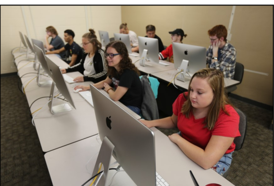
Stouffer G-7 Mac Lab