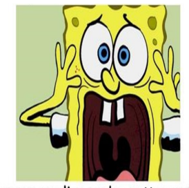
When you realize you're outta condoms