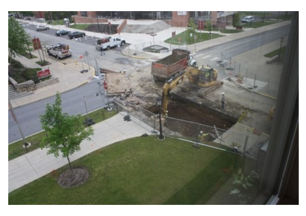
Installation of new condensate line across Pratt Drive and Maple Street intersection

The examples noted provide a sampling of the challenges required in the months preceding the summer construction season to assure work can take place in the time designated. Many times, one project must be completed so an additional project can follow. These projects take considerable planning, communication and coordination that happens routinely within all of the previously noted areas. Although many express concerns that the "the campus is always under construction in the summer," attempting to make improvements on the scale of the summer work during the time that the majority of the students are on campus would magnify the inconvenience to everyone by a large margin.