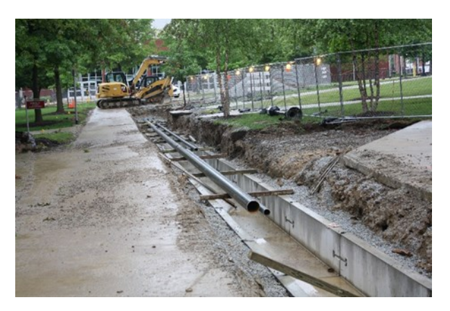
New steam and condensate lines being installed adjacent to Eberly College of Business