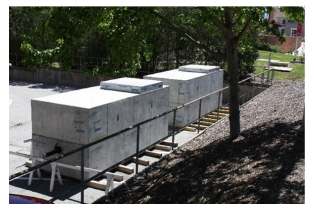
Two new water vaults staged for installation adjacent to the Cogeneration Plant