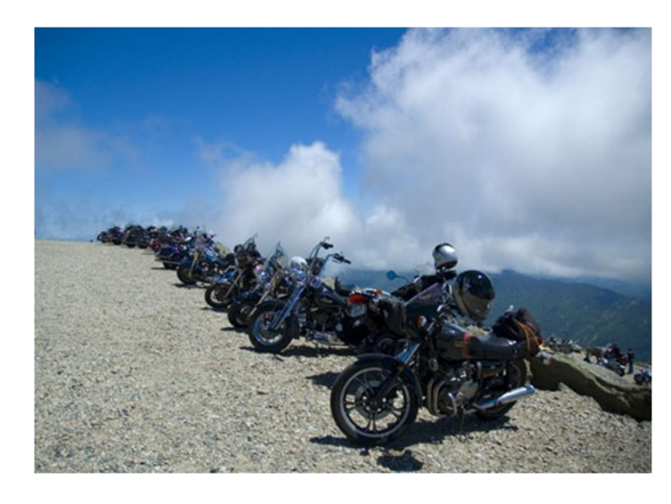
Bikers stop to rest and enjoy the view on the way to the top of Mt. Washington.

down. Just when you are questioning your sanity and your heart is thumping in your chest, the road becomes a little gentler and your goal is in sight. You truly believe you've reached the top of the world. A weather station, a snack bar, and gift shop are there to greet you, along with a panoramic view of endless mountains and valleys. It is reported that, on a clear day, you can see five states from the summit.