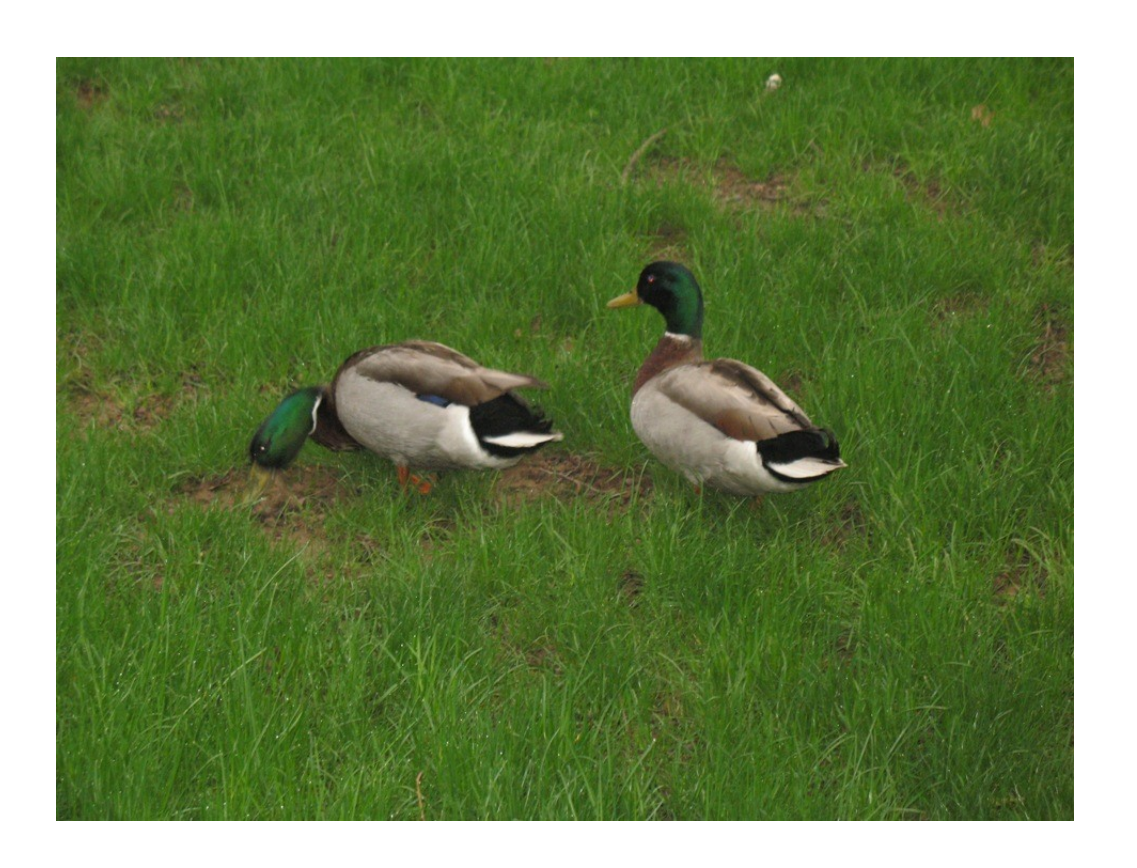
The Mallards-in-residence nevertheless enjoy their temporary home on the IUP campus.