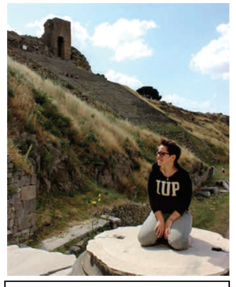
Me kneeling on a pillar base at temple of Dionysus with the city's theatre in the back-

This summer, I was blessed with the incredible opportunity of studying abroad in Turkey along with fellow students from the Robert E. Cook Honors College at IUP. For 32 days we flew, walked, hiked, ran, swam, sailed, and sang across a beautiful country, visiting countless museums, trekking through ancient city ruins, learning the history and culture of the Anatolian region, and, of course, eating really good food. We visited Troy, the famous city from Homer's The Iliad, the house of which it's said the Virgin Mary fled to after the death of Jesus. It is also the ancient city of King Midas and the Hagia Sophia—the only place in the world where Islamic symbols can be seen alongside Christian ones. I have fought off giant alien grasshoppers and kayaked with loggerhead sea turtles. I have performed a stage choreographed fight in the ancient theatre of Assos and toured the palaces of Ottoman sultans. I have unwillingly and accidentally sacrificed clothes to the Mediterranean Sea and made both Christian and Muslim pilgrimages.