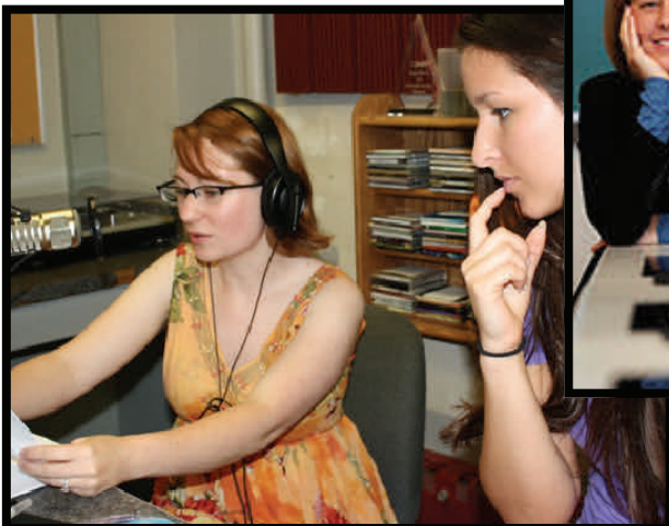
Strategic Visioning Students on Radio...

IUP has a diverse portfolio of funding streams that provides financial stability for the future.