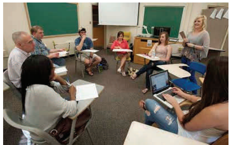
Strategic Visioning Project Team Interviews