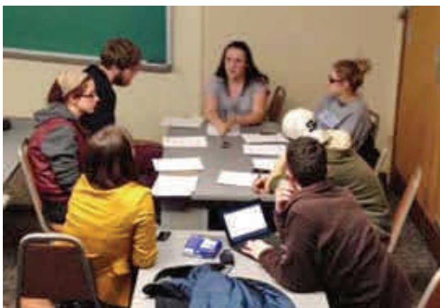
Strategic Visioning Project Team at Work