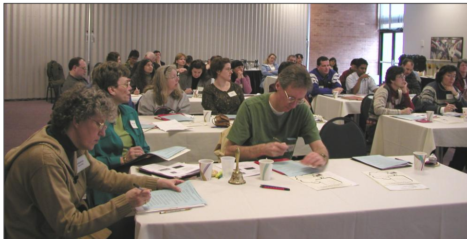
Some participants in spring workshop Learning Styles in the University Classroom: Fact or Fad?