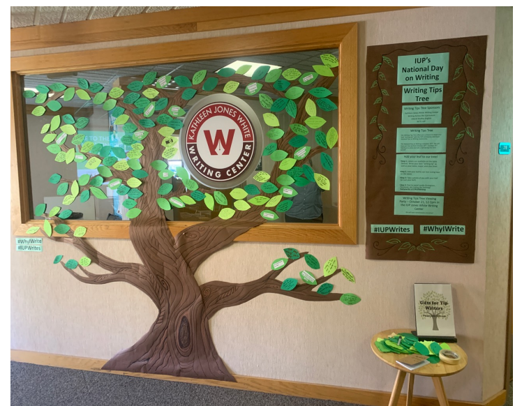
Image 3: Writing Tips Tree at the KJW Writing Center for the National Day on Writing

In collaboration with the Liberal Studies English and Writing Across the Curriculum program, we developed a "Writing Tips Tree" to celebrate the National Day on Writing in October 2019. Over 300 students, faculty, and staff visited and added a writing tip to our tree and over 30 campus community members came to our tips tree viewing party, hosted in the KJW Writing Center. Our tree was wellpublicized on social media and shared nationally through the National Council of Teachers of English.