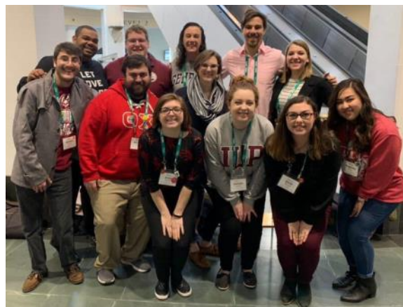
Right: SAHE student group picture on "Represent Your Institution Day" at ACPA