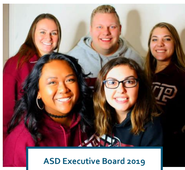
ASD Executive Board 2019