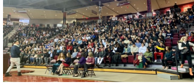
Above: Student Attendees

B-17 Delaney Hall ♦ 724-357-3402 iup.edu/socialequity social-equity@iup.edu ♦ title-ix@iup.edu