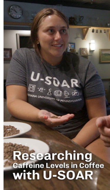
Researching Caffeine Levels in Coffee with U-SOAR

This fall, almost 2,900 students will be living in residence halls on the Indiana campus, with an additional 65 students living in Punxsutawney's Living-Learning Center. For the second consecutive year, move-in for new students included a one-stop check-in process at the Kovalchick Convention and Athletic Complex.